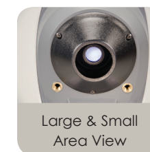
Large & Small Area View