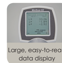
Large, easy-to-read data display