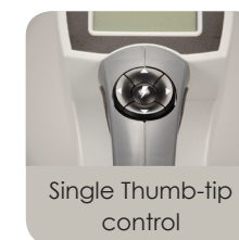
Single Thumb-tip control